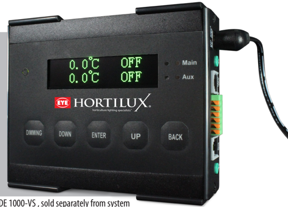
For use with EYE HORTILUX DE 1000-VS , sold separately from system

Using the EYE HORTILUX® GRC1 Master Controller for your EYE HORTILUX® DE 1000-VS offers you maximum control, ease of use, safety and plug-and-play installation. The GRC1 controller can switch all the interconnected systems on and off with its internal timer, adjust them to your required output level (in percentage or exact output power) and even simulate sunrise and sunset to gradually adjust the climate in your grow room when your lights go on or off. You can connect up to one-hundred systems to one controller and control two separate rooms or two accessories such as a humidifier and air conditioning.